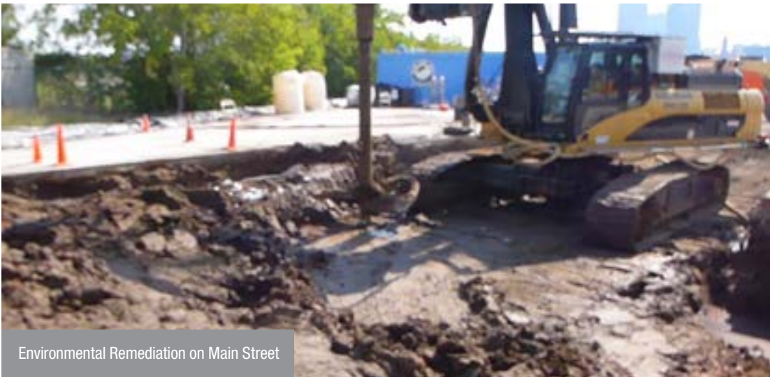
Environmental Remediation on Main Street