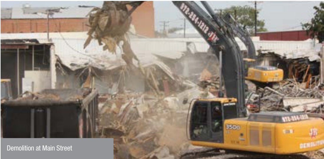
Demolition at Main Street

Check out the photos below that show actual project progress!