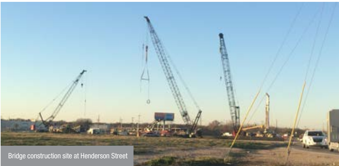
Bridge construction site at Henderson Street