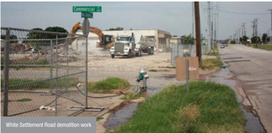
White Settlement Road demolition work